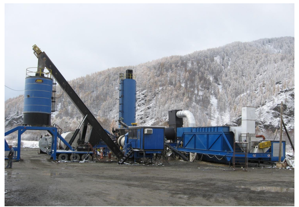
Figure 1 – Asphalt mixing plant Milemaker 160

Refueling of bitumen in the road impactor is carried out on bitumen bases. If the construction object is located far from a populated area, then it is advisable to carry out refueling of the tar sprayer with bitumen from the tanks by asphalt-mixing plant. Also, if the automated control system is mobile (Figure 1), then before relocation it is necessary to pump materials, including binder, from all containers. For this, a device is needed for pouring bitumen into vehicles from asphalt-mixing tanks [4].