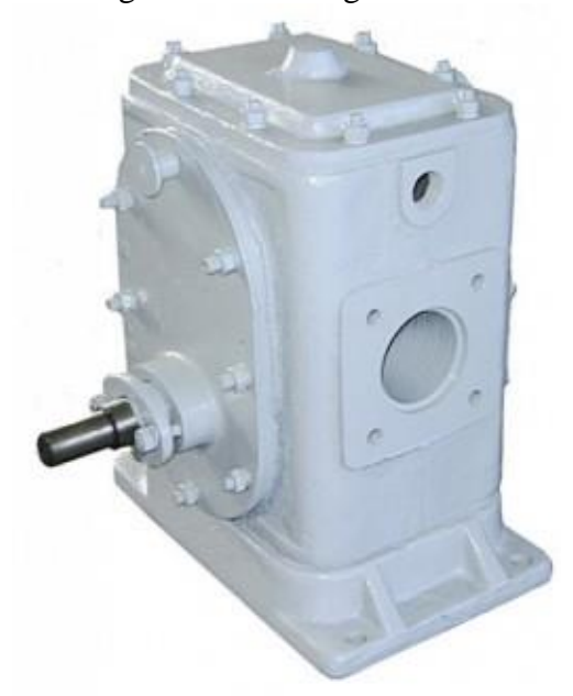
Figure 2 – Pump bitumen DS-125

According to q = 50 \text{ cm}^3 H p_p = 0.6 MPa suitable bitumen pump DS-125. The pump for bitumen loading is shown in Figure 2.