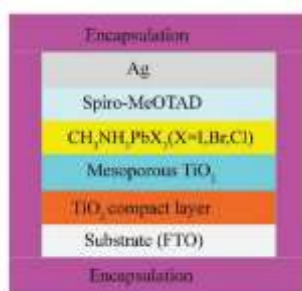
Figure 3 - Schematic illustration of perovskite solar cell encapsulation

manufactured by roll technologies can be very effective. In 2009, Krebs et al. developed a technology for the production of fully encapsulated flexible polymer solar cells [16].